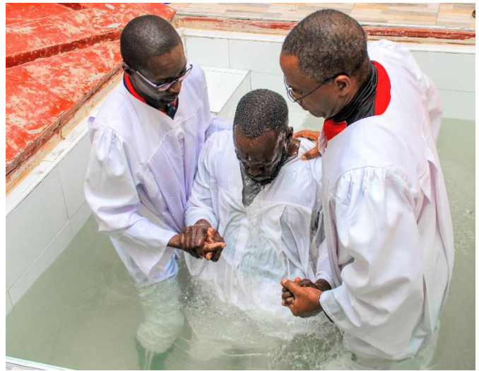
Baptism of Paul

Paul’s conversion unearths the great deception that is deeply entrenched in the ‘Word of Faith Movement’ in this country. Oftentimes I consider this movement a mission field from where we ought to harvest the lost souls for Christ Jesus.