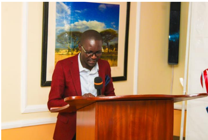
Preaching from Genesis 2:24 at our couples' dinner