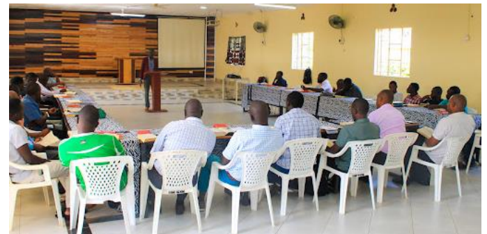
Men's breakfast in our hall.

In these past three months, we have sought to pay a special attention to the subject of Christian Marriage. In June, we held a men's breakfast that gave us an opportunity to address a group of men from various churches within Kisumu. The Lord helped me to open up Ephesians 5:25-33 to demonstrate what a husband's love for his wife should look like. One of the invitees lamented, "we have never had such sessions in our church, yet my marriage is calibrated with serious perennial struggles."