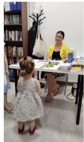
The Sunday school setup

We have also, after many years of planning, begun our Sunday school ministry. This began first with the older group (10-16 years) and has recently begun with the younger group (4-10 years). File numbers for the older group were great before the school holidays they have diminished a little with the children of regular attendees forming the core group. Our curriculum is a translation of the London Metropolitan tabernacles Sunday school program and utilizes a rewards-based program to encourage participation.