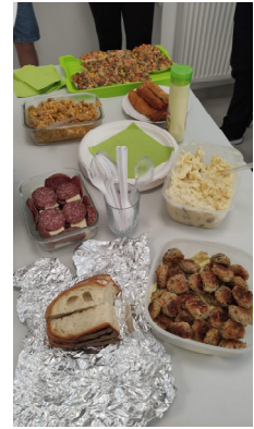
Saturday Biblical training sessions and a fellowship meal

In late September, we reverted to our previous arrangement, seeing the need for more regular Biblical input and holding the members to a higher account of meeting regularly. So far, this has been well received and well attended.