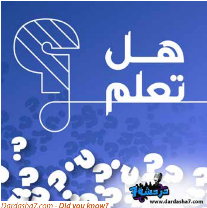
Dardasha7.com - Did you know?

Dardasha7 presents the gospel in a somewhat indirect fashion. In Arabic, “dardasha” means informal chatting, a conversation. The Dardasha7 website has audio radio programmes, articles and other materials on various topics. It interactively deals with different aspects of life that concern people as a means to introduce the gospel. Subjects