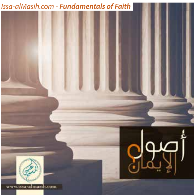
Issa-alMasih.com - Fundamentals of Faith

work of Christ. The website includes audio recordings of gospel messages prepared specifically for Muslims. It also has audio recordings of Scriptural passages which focus on sinful man’s desperate need for God’s saving initiative in Christ. It too invites website visitors to interact.