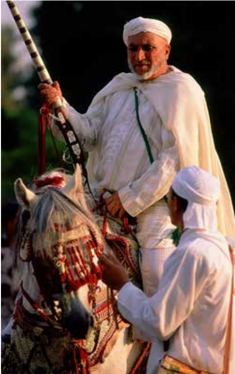
Traditional Amazigh warrior

A number of these engaging productions focus on reviving interest in Amazigh history and the heritage of the Amazigh Christian civilization of North Africa. These Amazigh language productions have been well-received and widely-discussed in their society. Some have become very popular and recently one received an award for excellence. Some are being