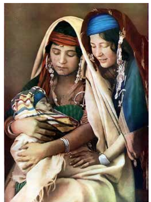
Amazigh ladies in traditional dress

Please pray for our Amazigh brothers and sisters. Their faith needs to be steadily nourished. Pray also for the protection of the North Africa ministry team.