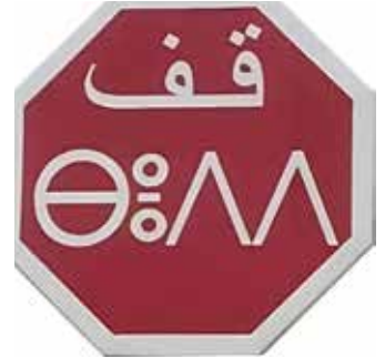
Arabic - Amazigh Stop sign