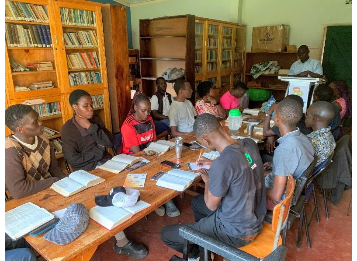
Evangelism & Bible Study at Maseno University.