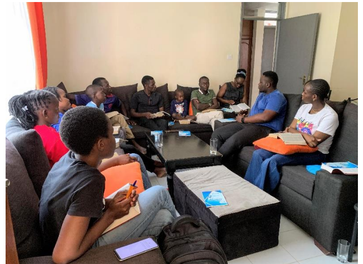
My wife and I spending a weekend with the youth.

John Piper once told the young people, "Don't Waste Your Life." So, I thought of telling the young people in our congregation, "Don't Wreck Your Life" (discerning the temptations of youth).